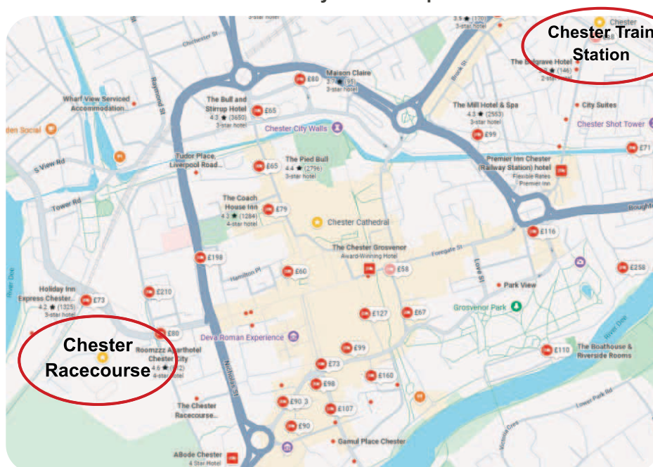
Chester City Center Map

Please note: the accommodation prices are daily rates per person (as shown below), searched in February 2026.